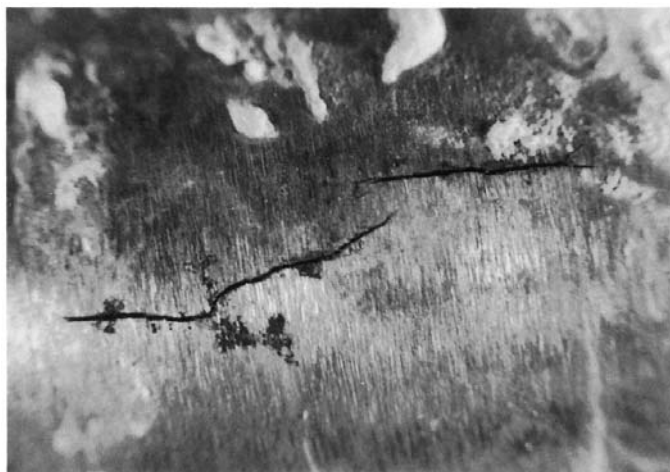
FIG. 2 Typical External Stress Corrosion Cracks (5× Magnification)

8.3 I.V. Bottles , 1 L or equivalent, to individually supply each test specimen with test liquid.